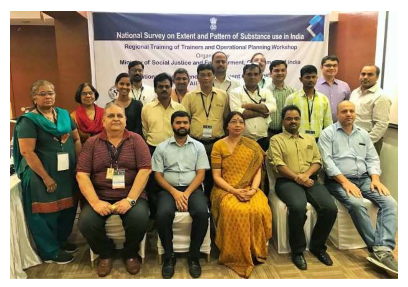
Participants pf Regional TOT, Pune, 24-28 October 2017

• Operational aspects of the HH Survey were discussed in detail in the concluding session of the day.