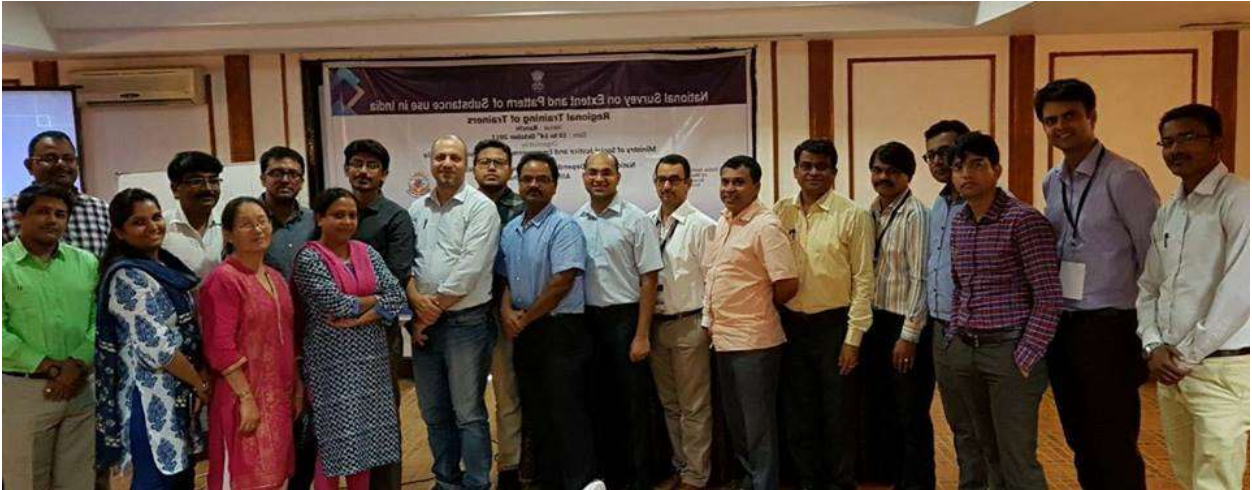
Participants of Regional TOT, Ranchi, 10-14 October 2017