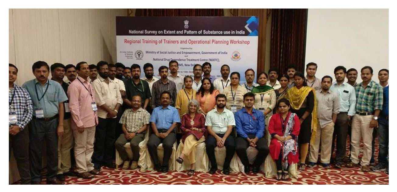
Participants of Regional TOT at Bengaluru, 9-13 October 2017

The detailed agenda followed at all the six workshops is provided in the Annexure. The workshop was conducted by the resource persons using various participatory training techniques such as power-point presentations followed by discussions, group work, Field visit, role-plays, theme-based discussions, demonstration of information management system etc.