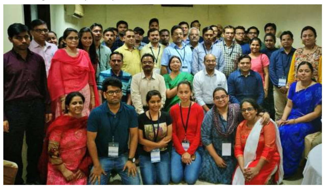
Participants of sixth Regional TOT, New Delhi, 31 Oct - 4 Nov 2017

Introduction to the survey website and MIS: The basic structure and functionality of the website developed for the survey and the MIS was demonstrated live to the participants. It was made clear that the website and MIS would undergo minor modifications but all the participants developed familiarity and expressed confidence in using it, once fully developed and launched.