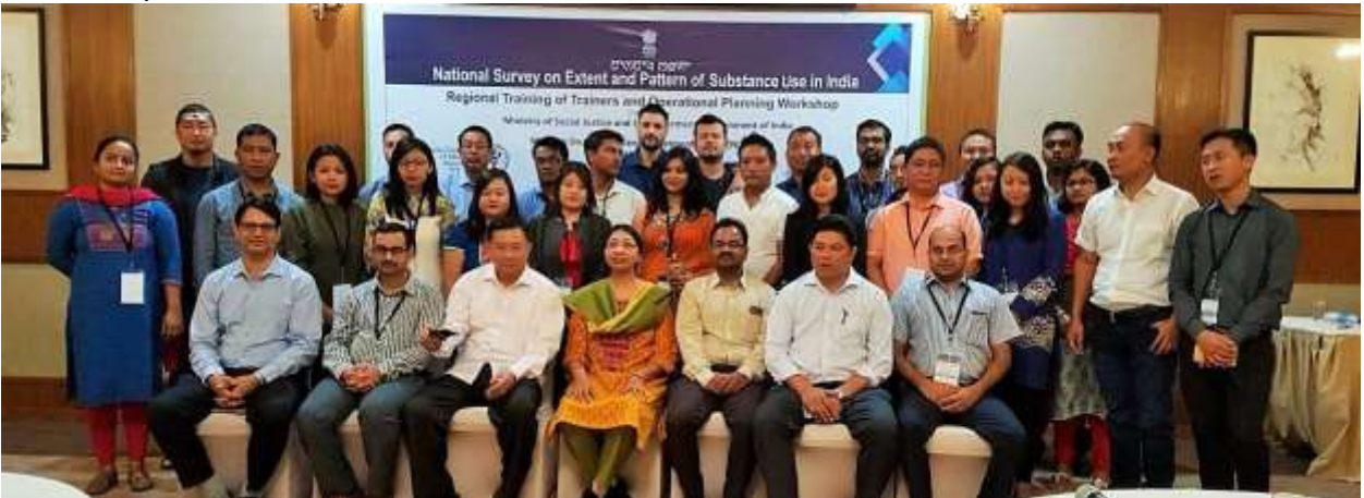
Participants of Regional TOT, Imphal, 24-28 October 2017